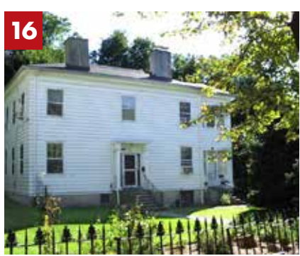
2 Liberty Street. Thomas Agate built this white clapboard house of Federal design before 1821. The wrought-iron fence came from the New York Custom House at 55 Wall Street before it became the National City Bank Building (Frank Vanderlip, president).