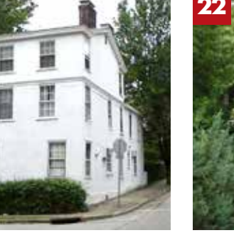
the turn of the century.