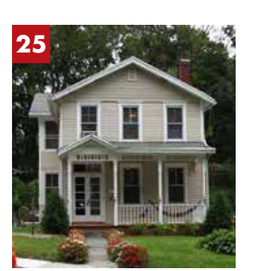
325 Spring Street. This white clapboard farmhouse is typical of the "Carpenter Gothic" style of the Victorian period.