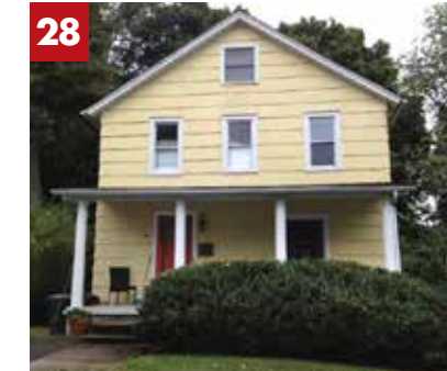
14 Fairview Place. Built in 1900.