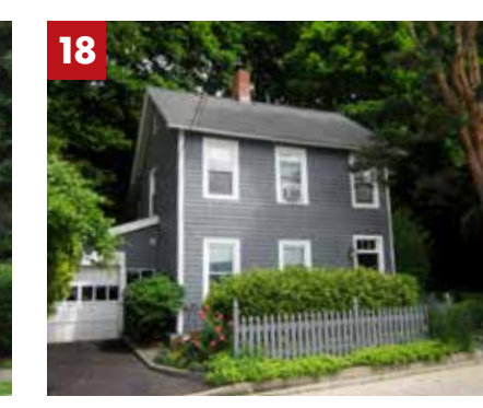
2 Hudson Street. The original house on this lot was built in 1820. It was later remodeled in the Second Empire style.