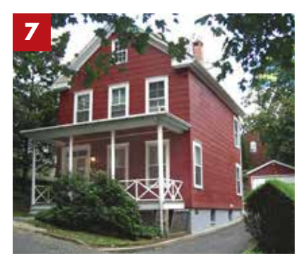
10 Still Court. This Greek-revival farmhouse was built in about 1870 by Isaac Still.