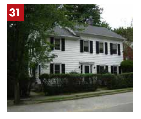
338 Spring Street. Bray Prince, an African-American, built this white-shingled Federal house in the 1830s. The south end of the house was added later.