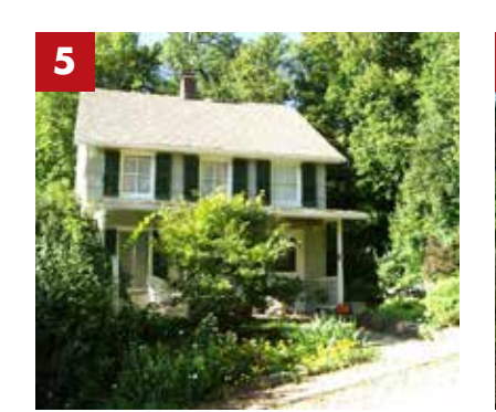
5 Still Court. This farmhouse was built after the Civil War and has a small center chimney that was designed for a stovepipe, not a fireplace.