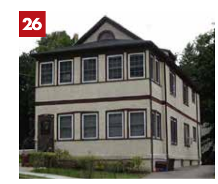
321 Spring Street. Built in 1840 this stucco building was once the Sparta School. Across the street was the entrance to the quarry that provided marble to build Sing Sing Prison in 1825.