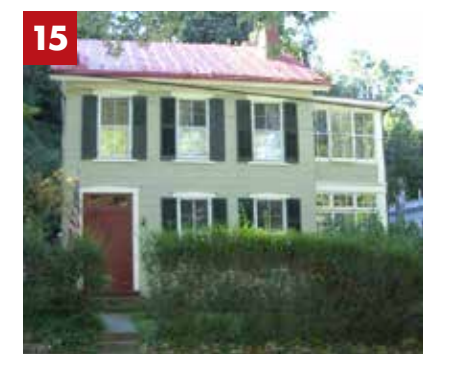
4 Liberty Street. This gray-shingled house of classic revival style was built around 1830, probably of clapboard construction. The sun porch was added later. The house was owned by William Jones in 1862.