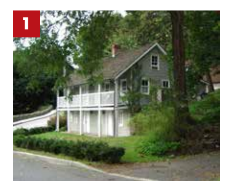
74 Revolutionary Road. The foundation of The Jug Tavern is one of Ossining's oldest. Rebuilt in 1883, it was listed on the National Register of Historic Places in 1976.