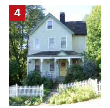
3 Still Court. Built in1896.