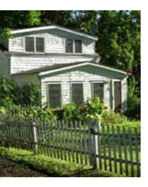
12 Still Court. Built in 1900, this much added-onto cottage is set back from the road and almost hidden by the surrounding woods.