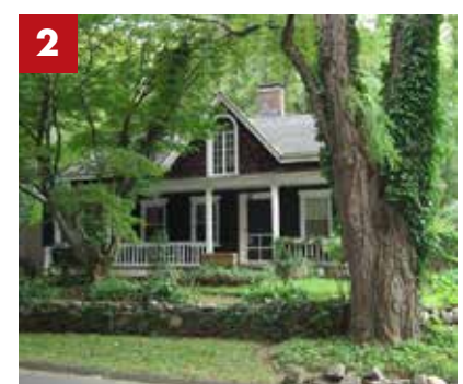
60 Revolutionary Road. This shingle house was originally clapboard and was one of the earliest houses in Sparta. The porch and peaked dormer were probably added in about 1850.