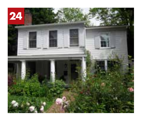
329 Spring Street. This farmhouse was built in 1834, probably of clapboard. The porch and a wing were added later