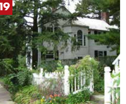
7 Liberty Street. This white clapboard house was built before 1820, and the chimneys are original. The front door and porch were moved to the side of the house for privacy.